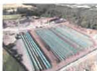
composting facility Austria