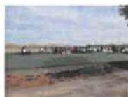
composting facility Spain