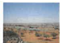
composting facility Kenya