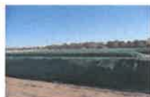
composting facility Royal Court Oman