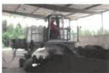
indoor composting facility Germany