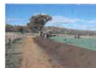
composting facility Australia